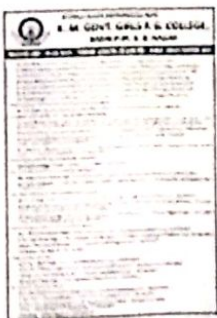
IQAC Structure.jpg 1543K